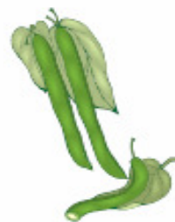
green beans 四季豆